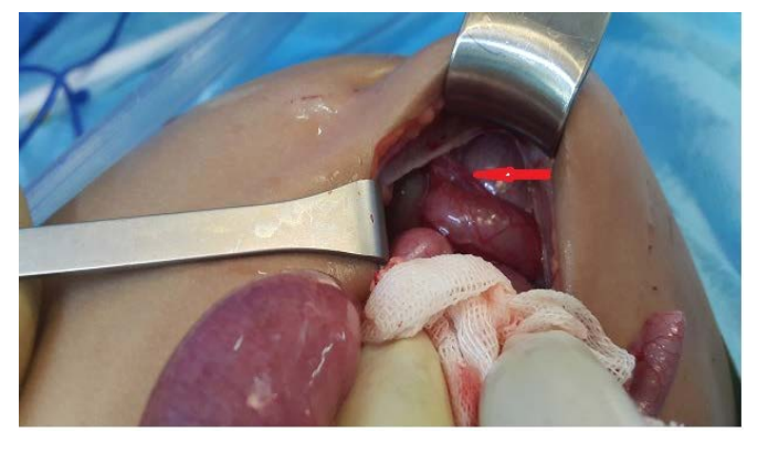
Figure 2: Red arrow indicates the ompholomesteric band.

The cause of NI intestinal obstruction was bandrelated obstruction in 7 patients (figure 2) and volvulus in 2 patients (figure 3). Volvulus was in the form of internal herniation due to a patent omphalomesenteric band. Ileus developed in the first month postoperatively in both of the patients who were operated for volvulus, and bridectomy was performed in only one of them.