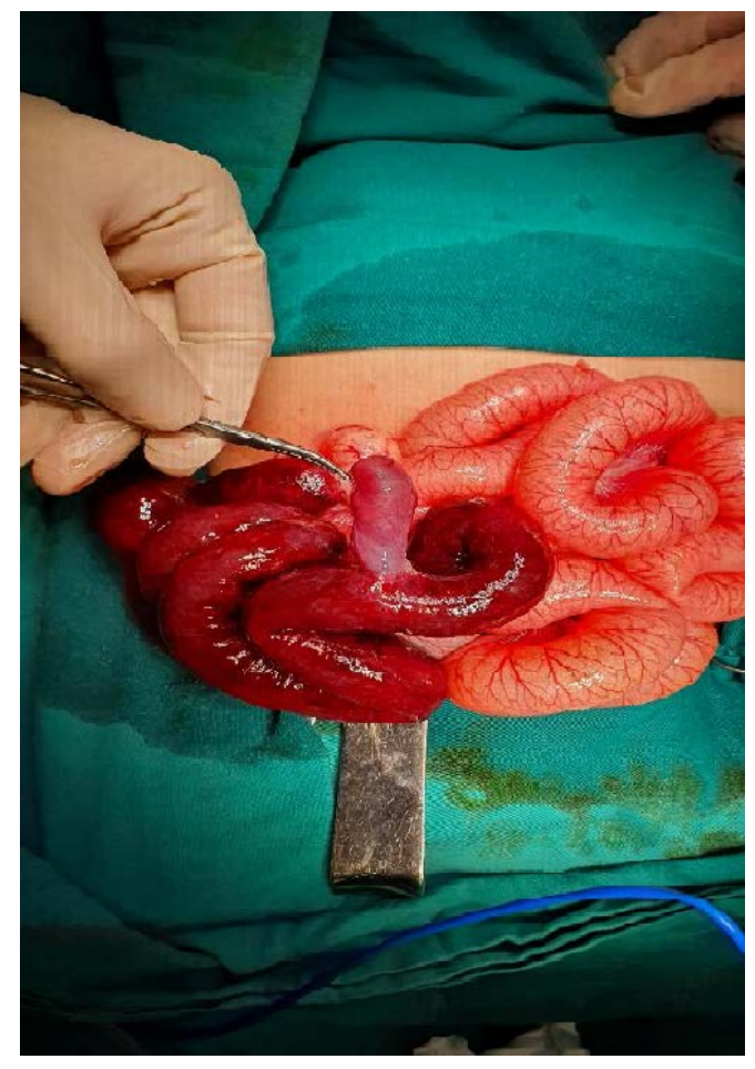
Figure 3: Volvulus due to Meckel's diverticulum

Tc-99m pertechnetate scintigraphy performed on all patients presenting with GI bleeding. The diagnosis was made by the presence of ectopic gastric mucosa in the right lower quadrant of all patients on scintigraphy. Pre-op erythrocyte transfusion was performed in patients because hemoglobin/hematocrit values due to massive bleeding. Elective surgery was performed after all patients were hemodynamically stable. Laparoscopy-assisted Meckel wedge resection and 16.7% (n:1) and laparoscopy-assisted segmental bowel resection were performed in 83.3%(n:5) of the patients who presented with GI bleeding. In the postoperative period, ileus developed only in 1 patient, which resolved with conservative treatment.